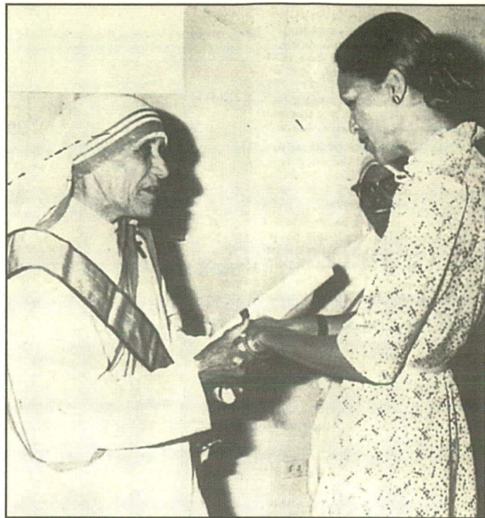
Mother Teresa with Michèle Duvalier in Haiti. The photograph appeared in the January 1981 edition of L'Assaut , Jean-Claude Duvalier's propaganda paper.

HITCHENS: Not according to the testimony of a number of