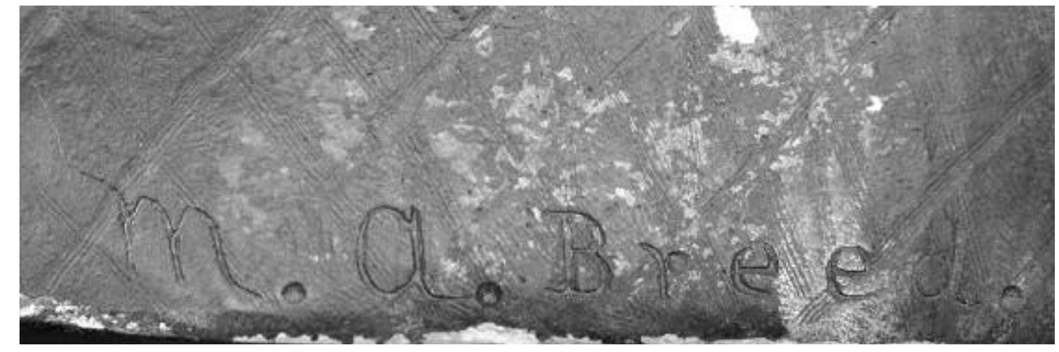
Inscription by the dealer and perhaps the sculptor, Peoria art dealer M. A. Breed.

It is expected that Buffalo State College will finish restoration of the bust at some time during the 2012 season, and that the restored Breed bust will go back on display in the Robert Green Ingersoll Birthplace Museum as soon as practical thereafter.