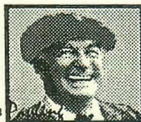
Dr. Linus Pauling