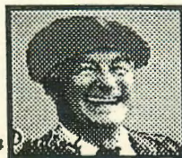
Dr. Linus Pauling