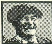
Dr. Linus Pauling