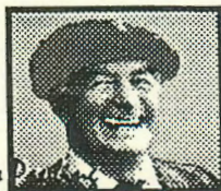
Dr. Linus Pauling