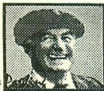
Dr. Linus Pauling