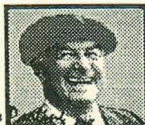
Dr. Linus Pauling